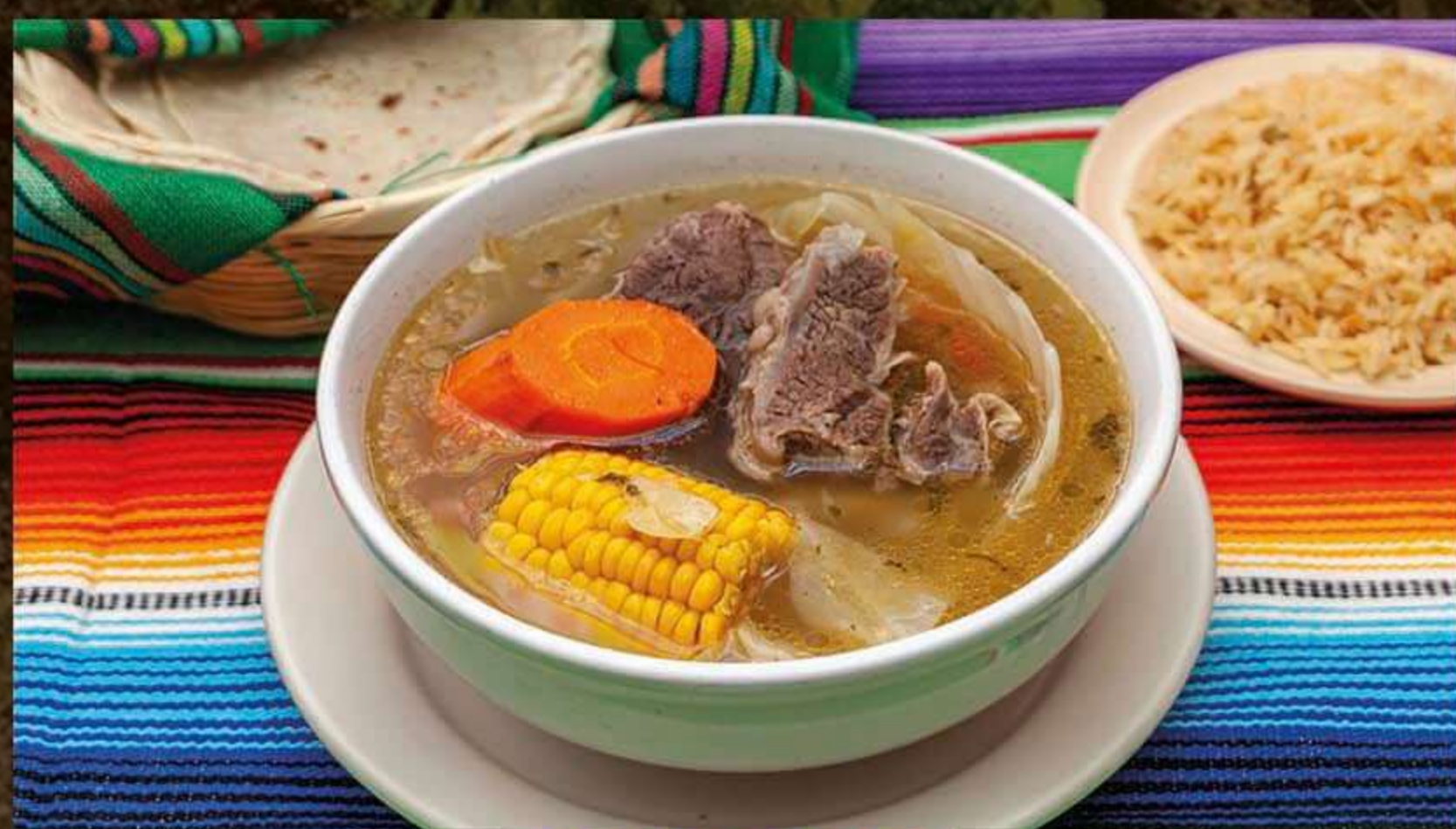
CALDO DE RES

Slow simmered beef tripe soup with a red chile broth. Served with or without hominy. Garnished with onions, oregano, cilantro, jalapeno, and lime.